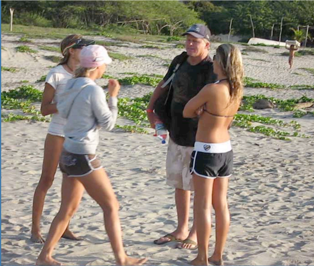
So we sat on the beach and watched the special people come. There were about 8 surfers and two boogie boarders. Here is one of the boogie boarders in the picture below. She couldn't even paddle out past the current.