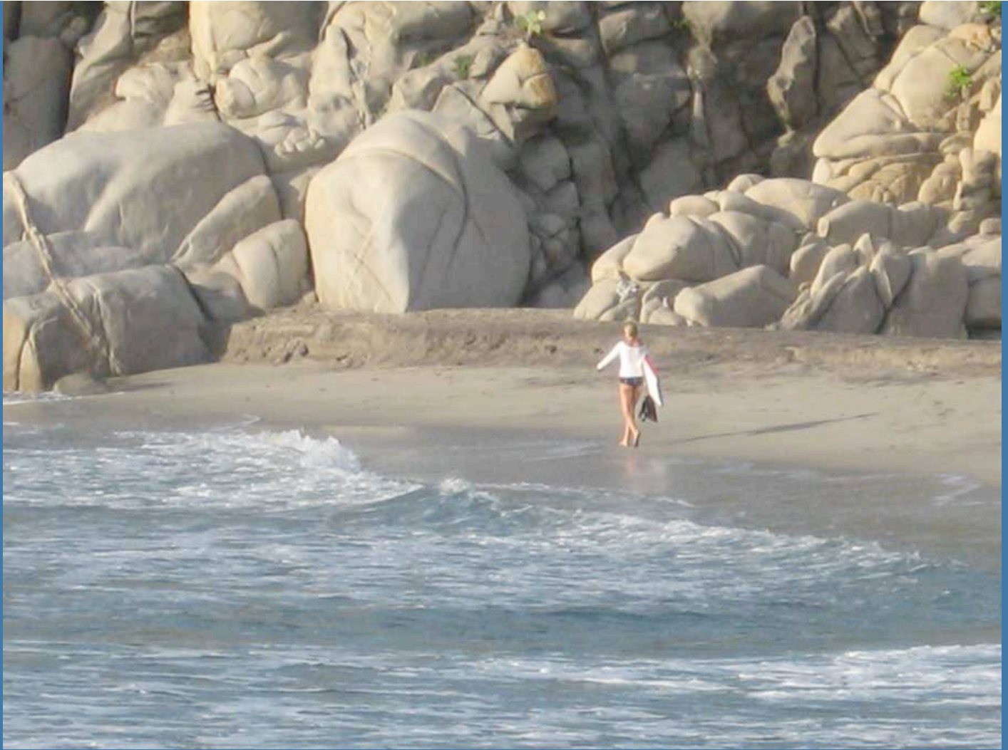
Here is another picture of one of the surfers. This guy in the picture below told us to "Piss Off" and then he said "Get Off of our Beach NOW" - and he started acting like a lunatic so we walked away.